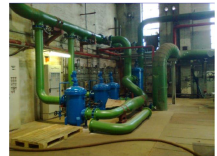
Fig. 2: Installation of BOLLFILTER system with pre-filter (background)