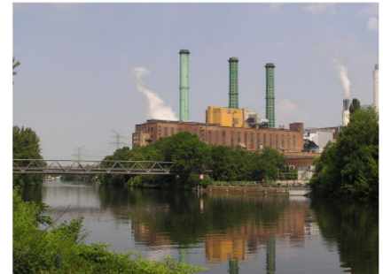
Fig. 1: Power plant Reuter; supplied with water from river Spree

An additional effect is achieved by a special coating of the filter candles, developed by BOLL & KIRCH („FouleX“). This coating prevents the filter elements from silting up and being attacked with algae, problems which can occur in such applications.