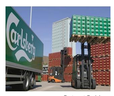
Crates at Carlsberg

1 x BOLLFILTER automatic Type 6.18 DN200 – 500 μm