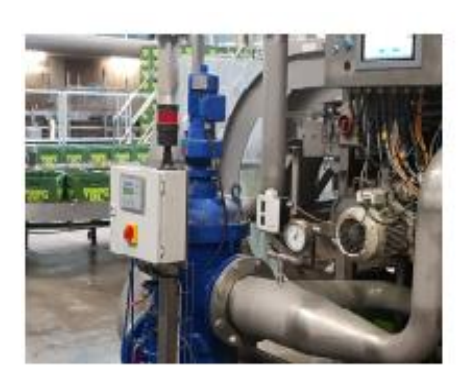
BOLLFILTER installed on crate washer